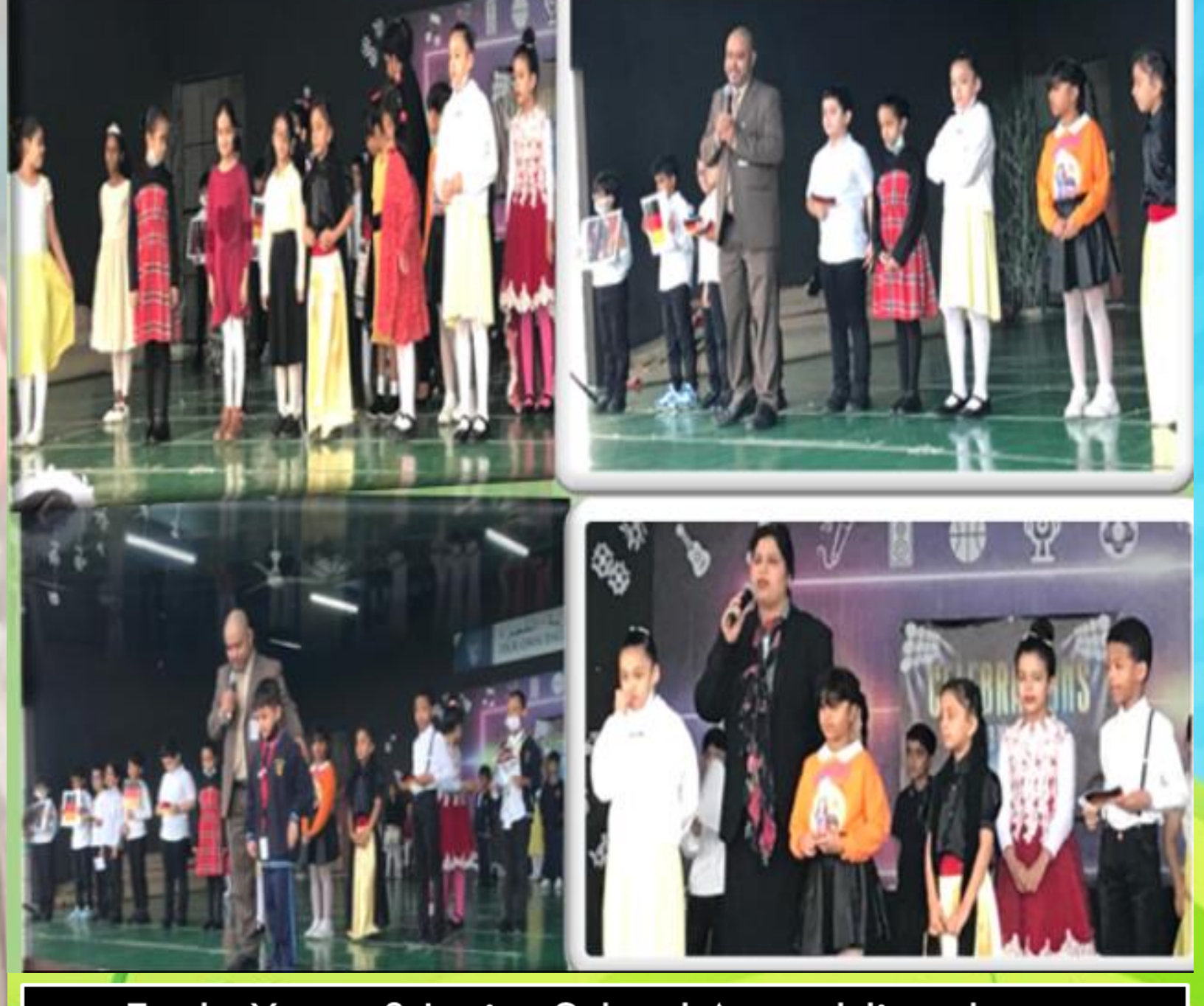
Early Years & Junior School Assemblies, theme "World Culture"

The Students of Early Years and Junior School of Our Own English High School conducted assembly on the general theme "World Culture with focus on Germany. They took us on a journey, enlightening their classmates with basic information of the country ranging from the colors of the flag, traditional clothes, food, music as well as few dance steps to go with the music.